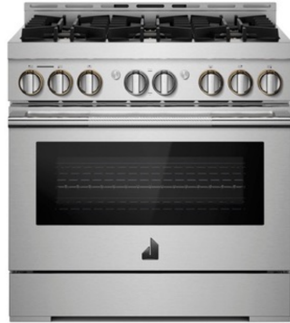
JennAir 36 inch Single Oven Gas Range

This built-in side-by-side refrigerator features our exclusive Obsidian interior that complements the convenient side-by-side design and exceptional food preservation. It also features an in-door water dispenser for ice and filtered water.