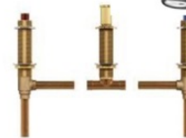
MOEN 2021133 Moen Align 4792 3/4" Metal Volume Control Qty: 1