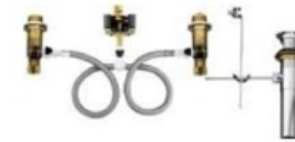
MOEN 2023200 Moen M-Pact 69000 1/2" Brass 8-16CC, Widespread Rough-In ANSI, ASME, CSA FIP For Widespread Lavatory With Pop-Up Waste Assembly Bulk Pack Qty: 2