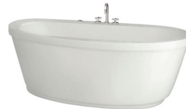
MAAX BATH INC 1551775 MAAX Jazz F 105359-000-001 66" x 36" x 24" Acrylic Above-Floor Rough-In, Freestanding Bathtub Center-Drain White Qty: 1