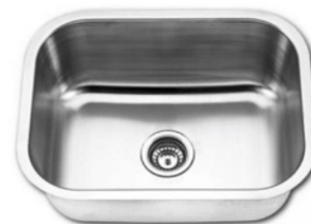
EMCO PRIVATE LABEL 1215622 MLUS771R 18GA SGL UM SINK Qty: 1