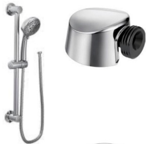
MOEN 2023135 Moen Eco-Performance 3669EP 4-Function, Eco-Performance Handshower Watersense 1.75 GPM With Check Valve, Metal Hose, Slidebar Chrome Qty: 1