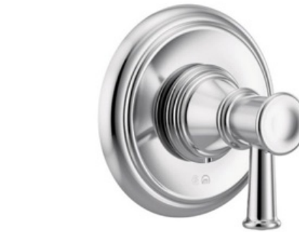
Moen 2022343 UT4301 BELFIELD MCORE XFER VALVE TRIM CH Qty: 1