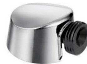
MOEN 2020150 Moen A725 1/2" IPS Round Drop Ear Elbow For Shower Without Post Chrome Qty: 1