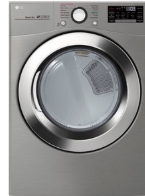
LG 7.4 cu.ft. Stackable Vented Electric Dryer

This Ultra Large Capacity Front Load Washer with Steam and Wi-Fi Connectivity loads at once to save time. Ultra-large capacity (5.2 cu.ft.) means you have the room to do more laundry in fewer loads. Our steam technology gently but powerfully penetrates fabrics to virtually eliminate dirt, odors, and wrinkles.