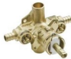
MOEN 2028099 Moen M-Pact 62360 1/2" Brass 1/4-Turn Pressure Balance 4-Port Rough-In ASME, ASSE, CSA PEXCR For Bathtub & Shower With Posi-Temp, Stops Bulk Pack Qty: 1