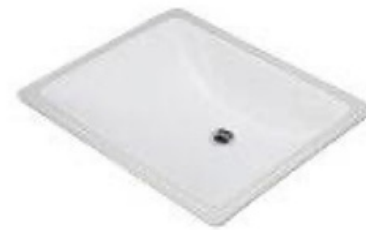
GERBER 1250290 Globe Union Logan Square 12-765 18-3/4" x 14-3/4" Vitreous China 1-Bowl, Rectangular Undermount Lavatory Sink White Qty: 2