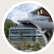
2 University of Victoria