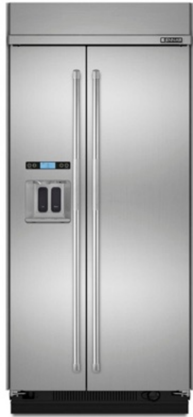
JennAir 29.5 cu.ft. Built-In Side-by-Side Refrigerator

This built-in side-by-side refrigerator features our exclusive Obsidian interior that complements the convenient side-by-side design and exceptional food preservation. It also features an in-door water dispenser for ice and filtered water.