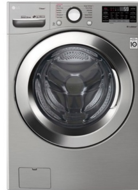
LG 5.2 cu.ft. Front Load Steam Washer

This Ultra Large Capacity Front Load Washer with Steam and Wi-Fi Connectivity loads at once to save time. Ultra-large capacity (5.2 cu.ft.) means you have the room to do more laundry in fewer loads. Our steam technology gently but powerfully penetrates fabrics to virtually eliminate dirt, odors, and wrinkles.