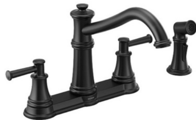
MOEN 7255BL MOEN BELFIELD Qty: 1