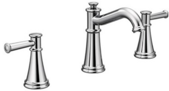
Moen 2027775 Moen Belfield T6405 High-Arc Bathroom Faucet With 2-Handle Chrome Qty: 2