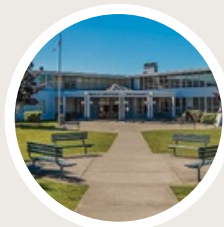
4 Mount Douglas Secondary