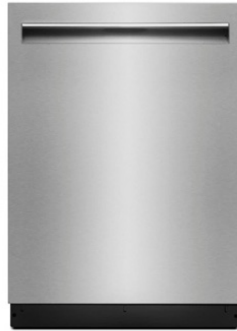
JennAir 6 Cycle Dishwasher with Hidden Controls

Precise, dual flames produced by precision-drilled brass burners. Inside the oven cavity, steady heat weaves around each flat tine. From searing select cuts and simmering sauces to succulent roasts, these ranges offer unmistakable firepower.