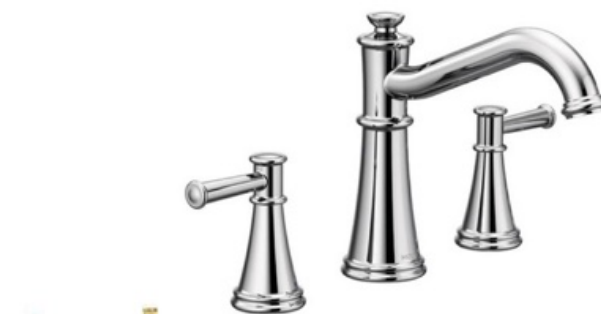
MOEN T9023 ROMAN TUB FILLER Qty: 1