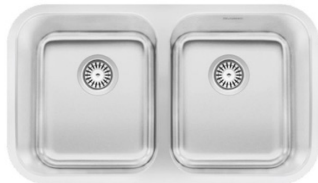
Blanco 401234 HORIZON PLUS U2 D BL SINK Qty: 1