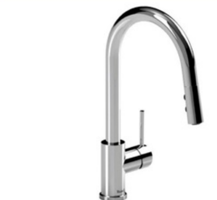
RIOBEL 2054209 Riobel Njoy NJ201C Qty: 1