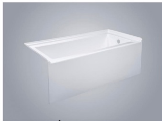
Venco Products Ltd. 1267615 TUS6030SKR 60X30MIMIMALIST APRN TUB RH Qty: 1