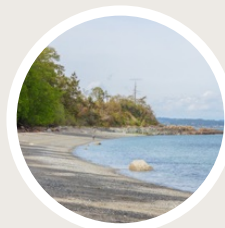
3 Cormorant Point