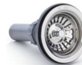
Franke 1217052 Stainless Steel Strainer Assembly Qty: 1

*Features and finishings are subject to change at the developer's discretion*