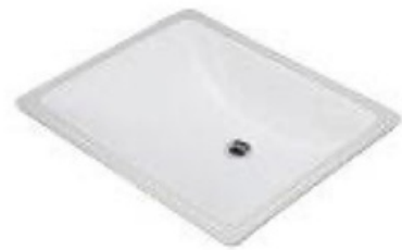
GERBER 1250290 Globe Union Logan Square 12-765 18-3/4" x 14-3/4" Vitreous China 1-Bowl, Rectangular Undermount Lavatory Sink White Qty: 2