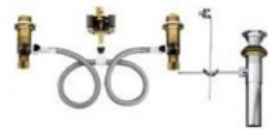
MOEN 2023200 Moen M-Pact 69000 1/2" Brass 8-16CC, Widespread Rough-In ANSI, ASME, CSA FIP For Widespread Lavatory With Pop-Up Waste Assembly Bulk Pack Qty: 2