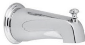
MOEN 2022950 Moen 3808 Diverting Spout Chrome Qty: 1